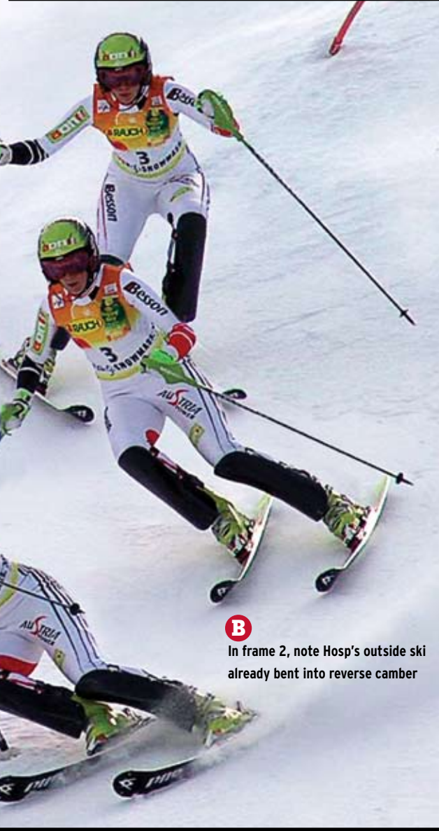
B In frame 2, note Hosp's outside ski already bent into reverse camber